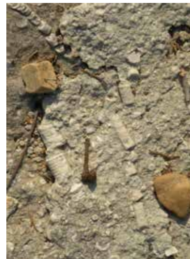
Stop 2. Crinoid columnals

Two features are present in the St. Joe Limestone at this location. The first feature resembles teeth protruding from beneath each bed of rock. This feature is a type of karst weathering called scalloping and is formed by the dissolving of limestone by slightly acidic groundwater when it flows along natural cracks or fractures. The second feature, known as a stylolite, is a line in the rock that resembles a small wave. This is an irregular surface that formed when the rock dissolved due to the pressure of the overlying rocks.