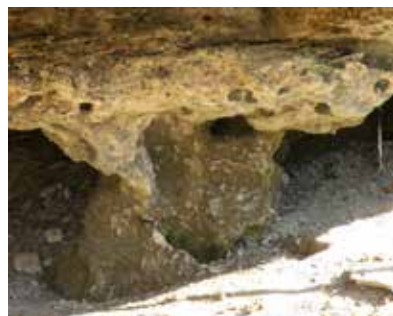
Stop 4. Travertine

Stop 3: A noticeable slope begins just below the bluff of the St. Joe Limestone. A change in slope indicates a change in rock type. In this case, the slope-forming rock is the Chattanooga Shale, a black brittle shale that breaks down, or weathers, into very thin flakes. Since shale breaks down faster than limestone, gentle slopes are formed, usually covered by vegetation. The best outcrop of this black shale is located along the creek just below the footbridge.