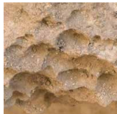
Stop 2. Scallops