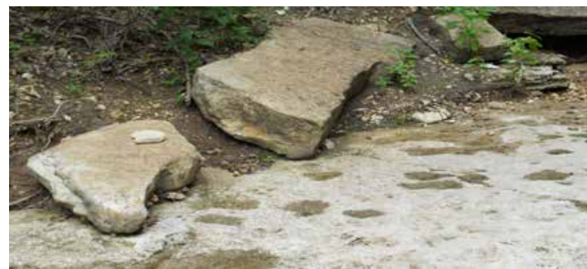
Stop 5. Powell Dolomite below slabs of sandstone in the Clifty Formation.

Stop 5: The contact between the Clifty Formation and the Powell Dolomite is visible in the creek, just a few steps off the trail. The Powell is light gray to white and is the oldest unit along the trail.