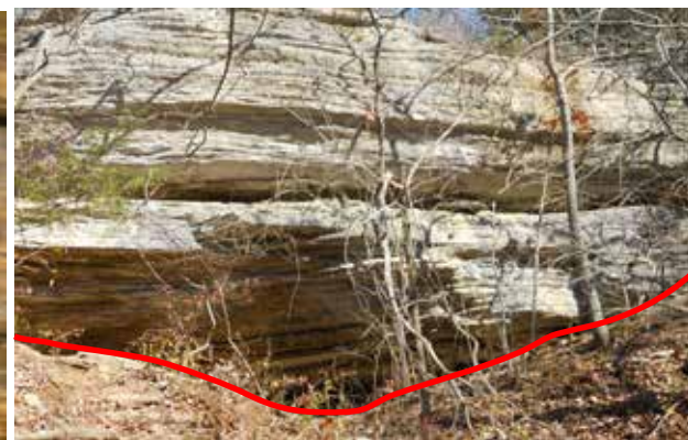
Stop 4. Contact between the St. Joe Limestone and the Chattanooga Shale (red line).

Stop 3: A noticeable slope begins just below the bluff of the St. Joe Limestone. A change in slope indicates a change in rock type. In this case, the slope-forming rock is the Chattanooga Shale, a black brittle shale that breaks down, or weathers, into very thin flakes. Since shale breaks down faster than limestone, gentle slopes are formed, usually covered by vegetation. The best outcrop of this black shale is located along the creek just below the footbridge.