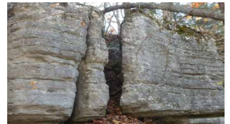
Stop 6. Widened joint created by dissolution of the limestone.

As you travel higher in elevation, toward the end of the trail, you will once again encounter chert fragments from the Boone Formation.