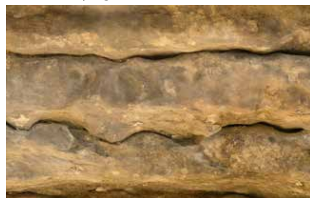
Stop 2. Stylolites